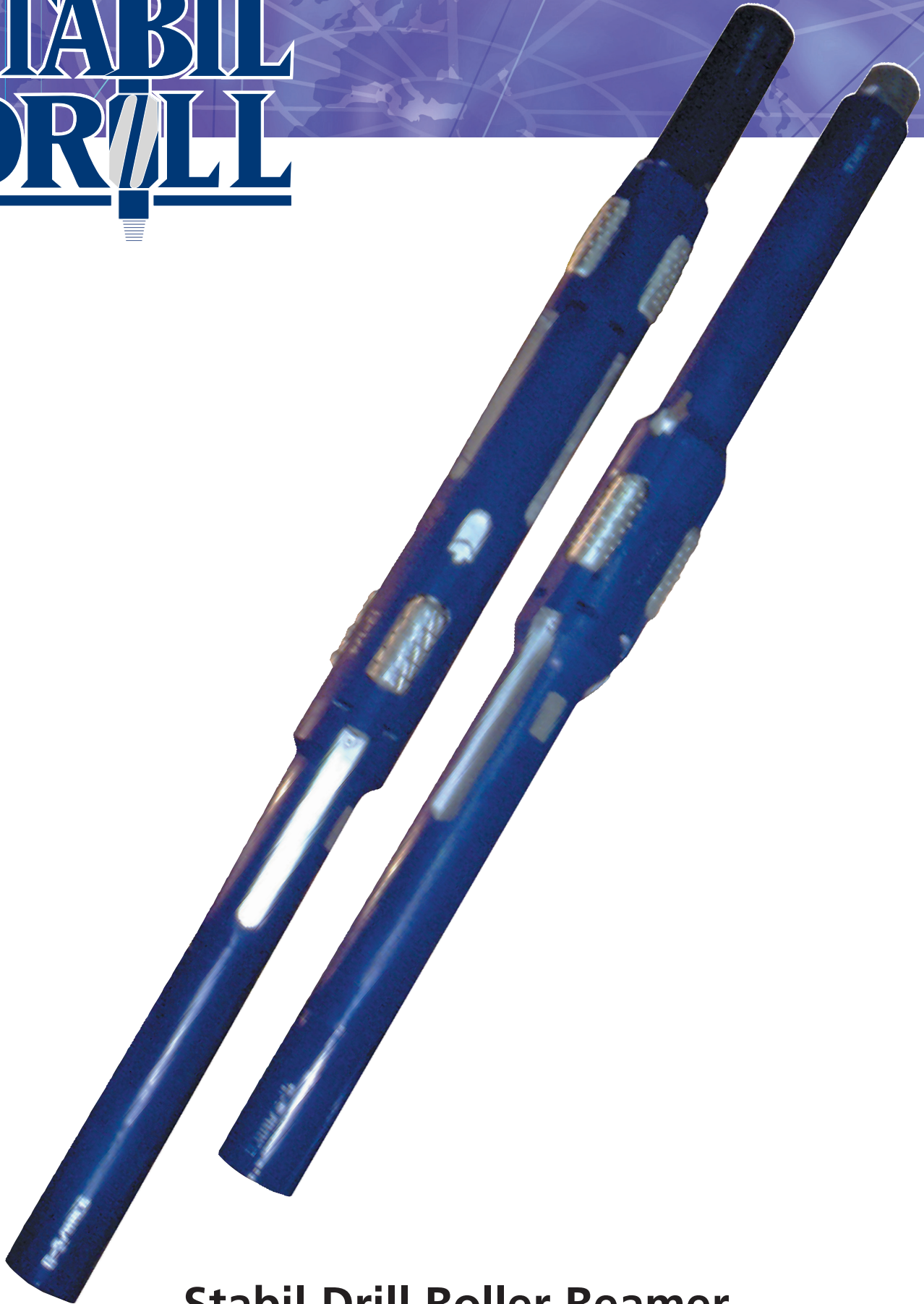
Stabil Drill Roller Reamer